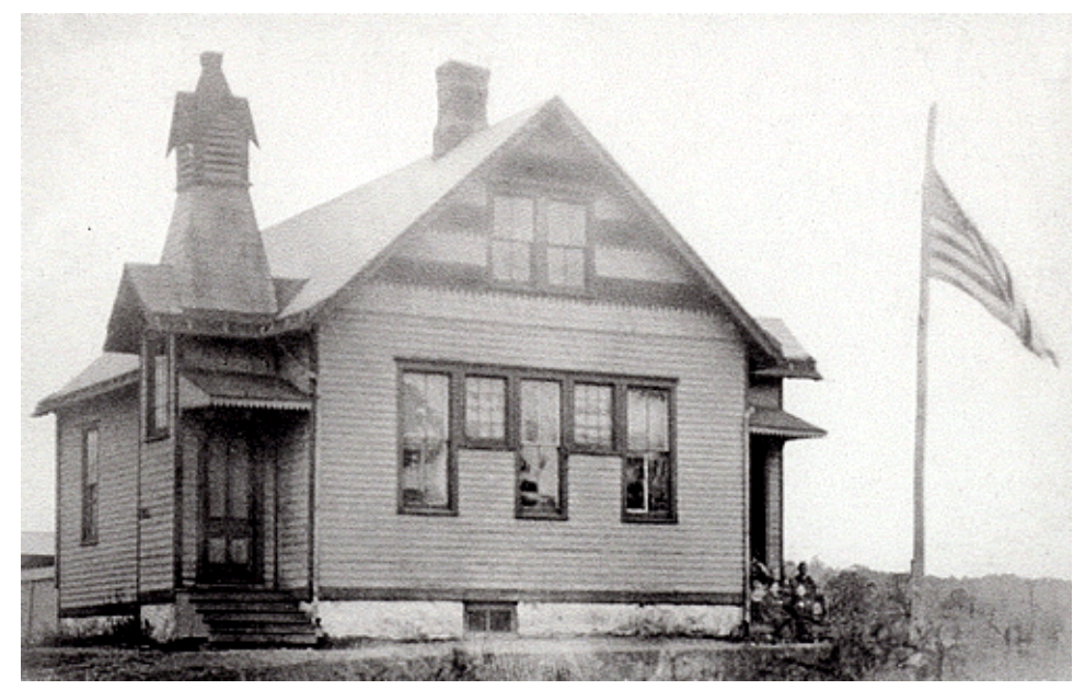
This photo of Pleasant Valley 1889 schoolhouse shows the modifications such as moving the bell tower, modifying the window plan, and much less decorative trim.

vernacular. The completed school can best be described as Folk Victorian in style. It is a scaled back version of Queen Anne style with its symmetrical cube design, patterned wood shingles in the front gable, a pattern in the slate roof shingles, overhanging eaves, the pyramid shaped roof, and vertical windows. The original design in the 1874 annual report was estimated to cost $1500 to $1600 to build. The cost of the actual building, achieved primarily by reducing the amount of trim, was more like $900. It was more than a simple vernacular school and exemplified the desire of the people to express pride in their community but, as practical farmers, without the unnecessary gingerbread trim.