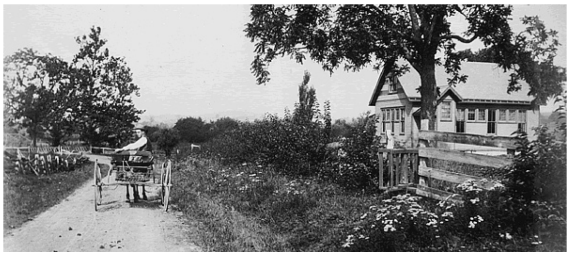
This photo of the Pleasant Valley Schoolhouse shows the east wall windows consisting of three vertical windows with upper windows in between making almost a complete wall of windows. This is quite different from the usual simple three vertical windows. In the 1874 plan there were only two vertical windows.

In winter, heat was provided by an iron stove probably located in the middle of the room with its cast iron legs sitting on a heat reflecting metal pad and with a pipe extending up and then making a right angle leading it to the chimney. The further away from the stove the colder the room was since there was no insulation in the walls and heat rose to the high ceiling. With doors and windows kept closed there was little introduction of new air and oxygen into the room. In hot weather only opening doors and windows provided air circulation and any cooling a cross breeze could offer.