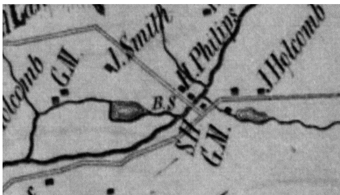
Detail from the 1849 Otley and Keilly Map of Hopewell Township showing the location of the Phillips's Mill Schoolhouse wedged between the road and Moore's Creek at the intersection of Pleasant Valley and Valley Roads.

On the 1826 map the schoolhouse is clearly shown located between the gristmill of William Phillips and the intersection of the road to Lambertville and the River Road, today's Valley Road and Pleasant Valley Road. It is wedged between the road and Smith's (now Moore's) Creek. Its proximity to the prosperous and well known grist mill led the people to call it the Phillips's Mill School.