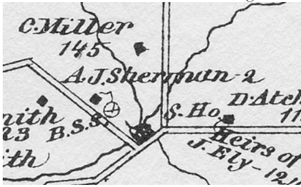
Detail from 1875 map of Hopewell showing the location of the Pleasant Valley district schoolhouse about the time it was repaired or replaced. The blacksmith shop is still in operation but the gristmill no longer appears on the map.

In 1870 the schoolhouse was only in fair condition and valued at $300. So, it was probably one of those schoolhouses that three years earlier was a frame building, not well ventilated, having insufficient grounds, and, if not unfit for use, perhaps close to it. The total cost for running the school was $199.38 and this money came from state appropriations ($20.84), the Hopewell Township tax ($102.00), and tuition ($76.54). It was not yet a free school and of the 63 eligible children only 56 enrolled, leaving seven who attended no days of school. Four students attended less than four months, nine attended between four and six months, 30 attended seven or eight months, and only 13 students attended the full year. While the average daily attendance in the old building was given as 46, this is undoubtedly a typographical error and it was more likely 16. This would be in line with reports for the next two decades when the average daily attendance fluctuated from 12 in 1871 to 19 or 20 in the mid-1870s to mid-80s. The next highest reported average attendance was 28 in 1883.